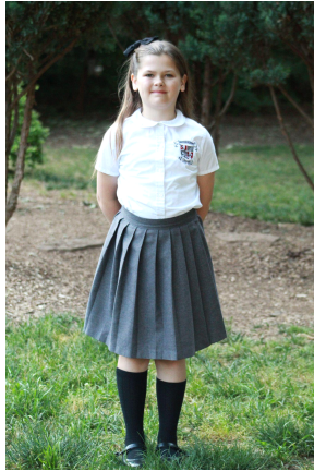
Logo required on dress shirt.