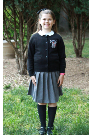
Sweater with Logo Required in 2nd and 3rd Quarters