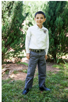
Logo required on dress shirt.