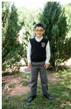
Sweater with Logo Required in 2nd and 3rd Quarters