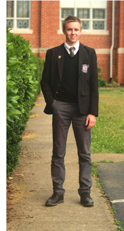
11th - 12th grades Blazer required year-round. Sweater optional.