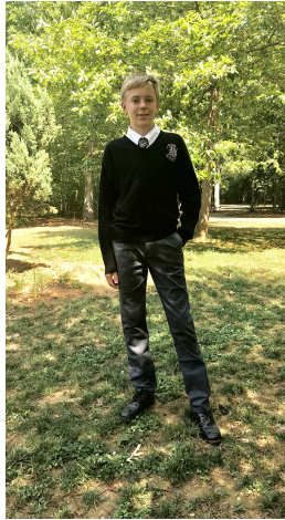
9th - 10th grade Sweater required 2nd and 3rd quarters. Logo required on dress shirt.