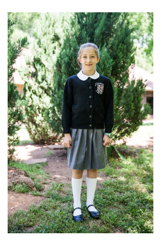
Sweater with Logo Required in 2nd and 3rd Quarters