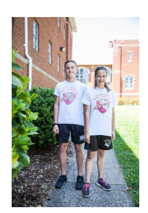
PE Uniform is REQUIRED and must be purchased from French Toast. (**Kindergarten - 1st grade students do NOT need a PE uniform.)

Required items: Short-sleeve t-shirt (#4105) and black shorts (#4115) In the cooler months, students may wear long sleeve t-shirt (#4106) and sweatpants (#4117). Items must come from French Toast only.