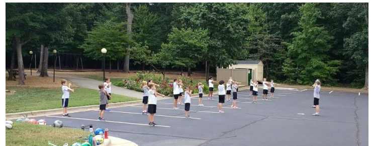
3rd and 4th Grades warming up for PE!