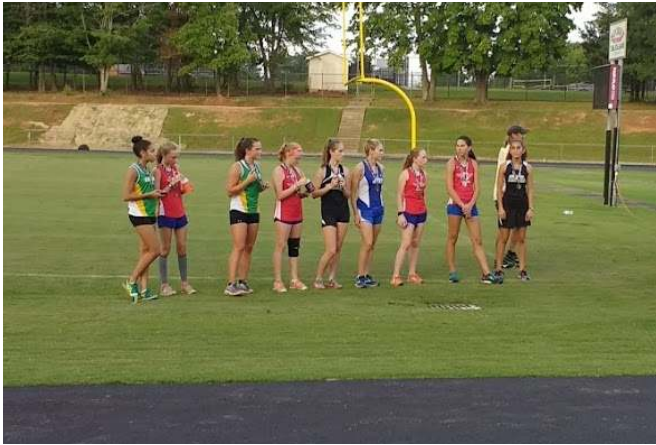
The team gathers for a prayer of thanksgiving after the race.