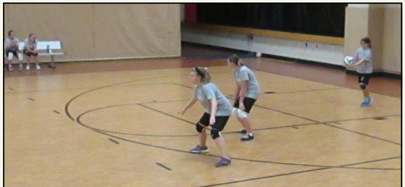
Hard loss on our home court (2-1) to the Home School Carolina Mustangs