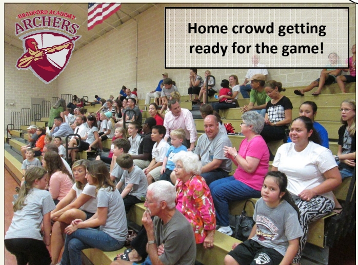
Home crowd getting ready for the game!

In short I believe that every parent, myself included, needs to think through biblical principles more often and more thoroughly when it comes to our stewardship. We are too often tossed about by every new fad, theory, or trend. Too often, we are instructed more by our emotions, selfish desires, or fatigue. If we want to be faithful stewards of this great privilege, we need to hear from Him who entrusted us with this stewardship. Peace and Grace.