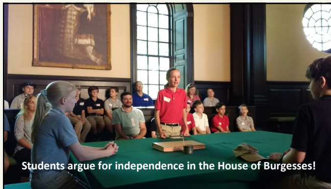
Students argue for independence in the House of Burgesses!