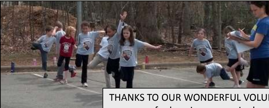
THANKS TO OUR WONDERFUL VOLUNTEERS for keeping us running!