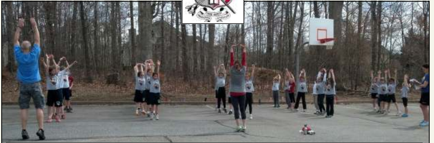
STRETCHING for RUNNING CLUB!