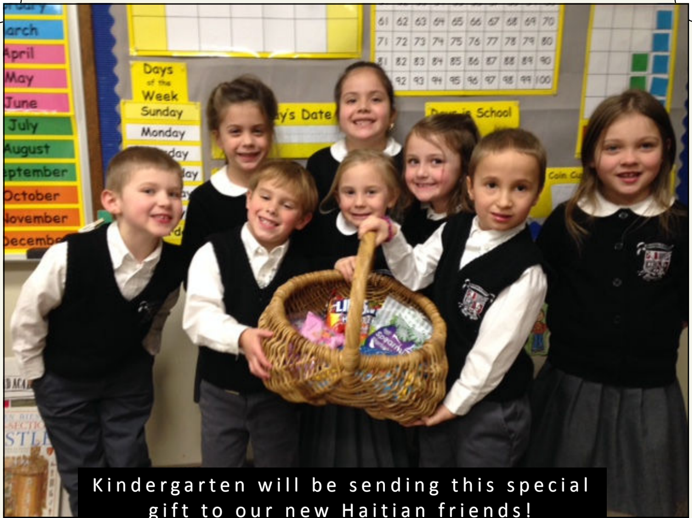
Kindergarten will be sending this special gift to our new Haitian friends!