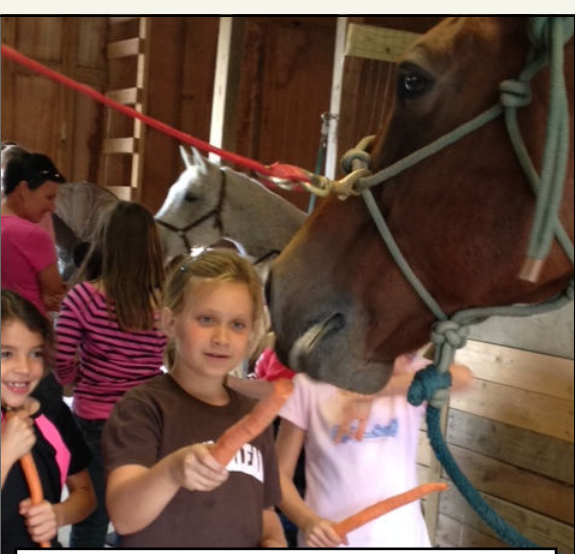
Giving the horse a treat, can get a little sloppy!