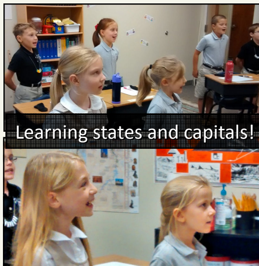
Learning states and capitals!

Is this a curse or a blessing? I think it could be either depending on the worthiness of the songs committed to memory. It is for this reason we, at Bradford Academy, are determined to have the students learn academic content by way of song as well as sing some treasures that are elevating to the soul. I hope that our kids will forever think of their good days at Bradford when they hear, "For the Beauty of the Earth" and "Non Nobis." I hope they will burst into song when they hear Baton Rouge, Louisiana. Songs will form parts of their memory, and the information retained by way of song will not fade into oblivion. As we labor to fill our minds and the minds of our children with good things, let us all sing songs worthy of remembering! Peace and grace!