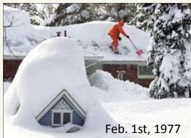
Feb. 1st, 1977

I can only image how the stranded people in Atlanta felt as they got word that their children would be spending the night at school. Imagine spending the night in a Chik-fil-A or a CVS because you can't make it home.