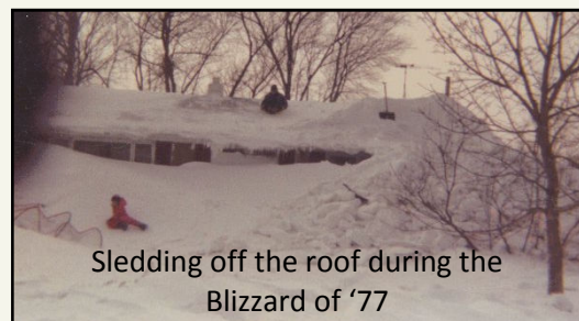
Sledding off the roof during the Blizzard of '77

When I was in elementary school we would occasionally get a snow day or an early release but it was rare. On one occasion, the famous Blizzard of '77, my sister and I were stranded at my aunt and uncle's house. It had been an early release and my parents could not be reached so we went to our secondary location only a few blocks from the school. My mother was at the local hospital with my two-year-old brother who suffered from croup, and my father was stuck at the chemical plant where he worked for four days. At the time I thought it was quite exciting! My mother said it wasn't much fun.