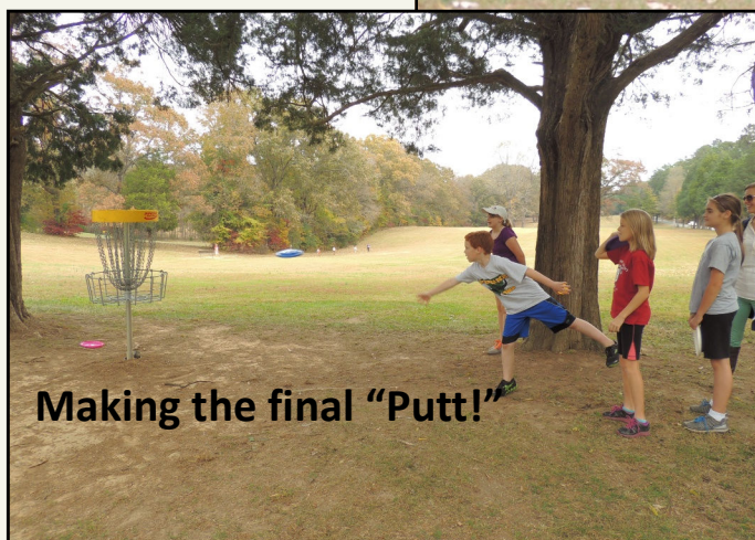
Making the final "Putt!"