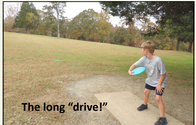
The long "drive!"

Some people love golf and some people love tossing a Frisbee. On Thursday of this week, the students enjoyed a round of that delightful combination of both games: disc golf! For many of the students this was their first time playing and I believe it was met with great enthusiasm. One student even quipped, "I wish I could do this all day!" The Lord blessed us with great weather. We were able to enjoy the easy pace walking the greens which extended through open grassy hills and wooded areas. The autumn leaves were in full color and the gentle breeze was just right to add an element of challenge to each toss of the disc. Cedarrock Park is a charming area to visit with its hiking trails, historical trails, and the excellent Disc Golf course. We trust the students will be asking to go back and do it again soon! Peace and Grace.