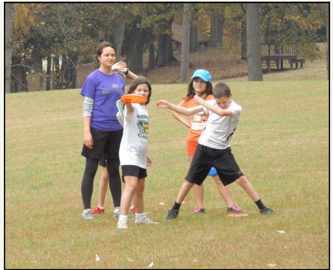
P.E.: Frisbee Golf Field Trip

Science: Chemistry Intro., Scientific Method