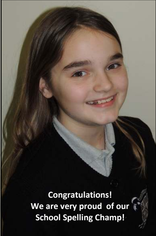
Congratulations! We are very proud of our School Spelling Champ!