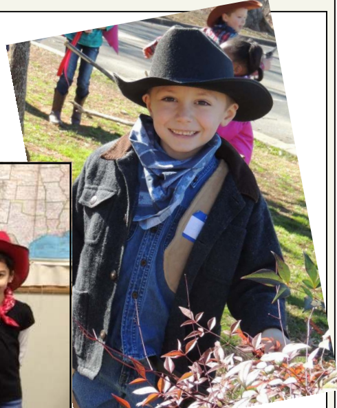
Kindergarten through 2nd grades celebrated the 100th day of school!