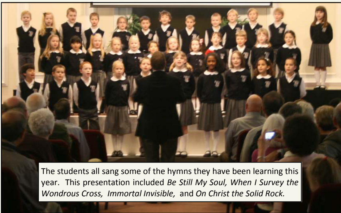
The students all sang some of the hymns they have been learning this year. This presentation included Be Still My Soul , When I Survey the Wondrous Cross , Immortal Invisible , and On Christ the Solid Rock .